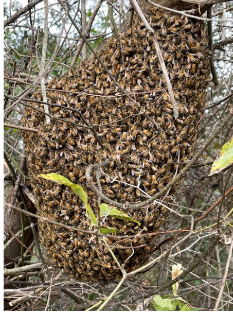
This was a swarm that the Beginning Beekeeping Class had boxed on March 19th.