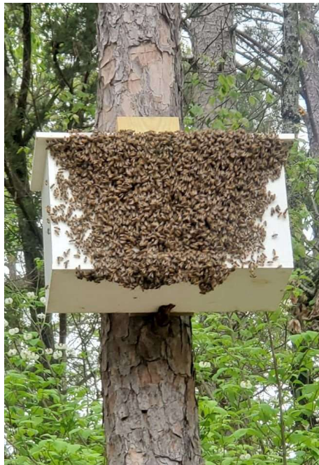
Photo Credit: MSBA Member Evan Thayer's first swarm. Good job, Evan!